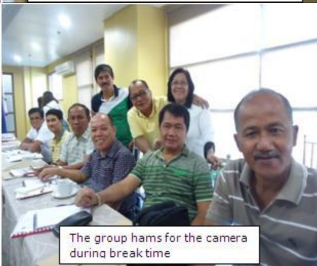
The group hams for the camera during break time