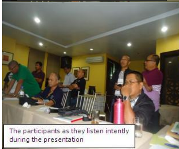
The participants as they listen intently during the presentation