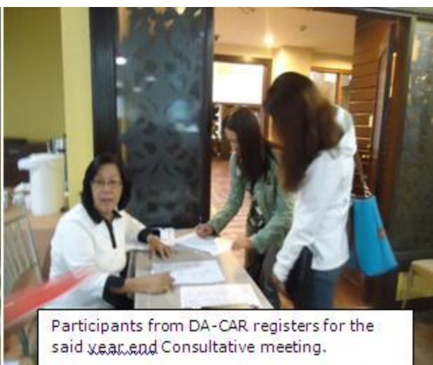
Participants from DA-CAR registers for the said year-end Consultative meeting.